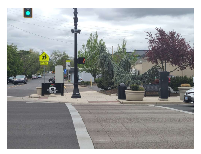
Originally Adopted by Ordinance No. 1955 March 8, 2012 Updated Plan Adopted by Ordinance No. 2091 November 17, 2022