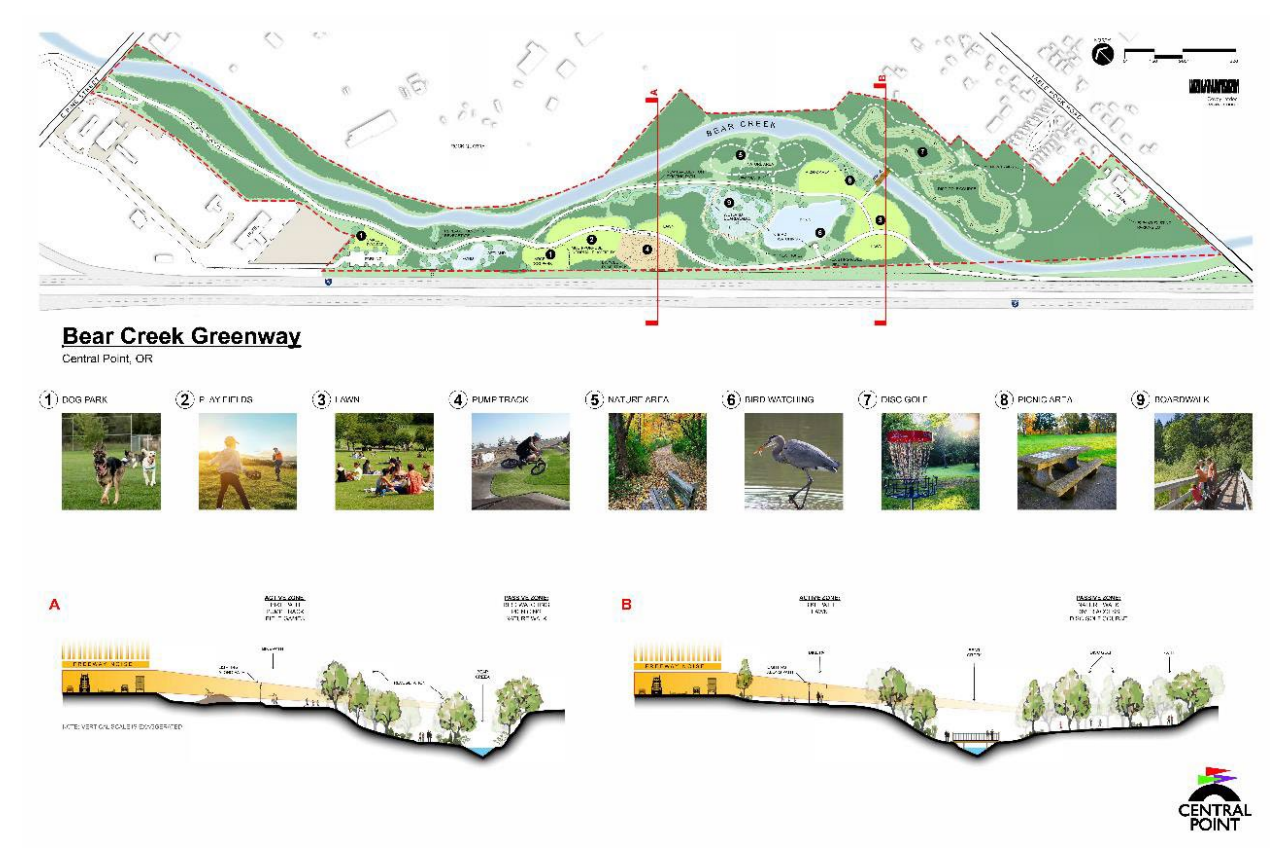
Figure 3 – Bear Creek Greenway Park Facility Design Concept

Conclusion, Parks Element Policies 3.1 – 3.10: Consistent.