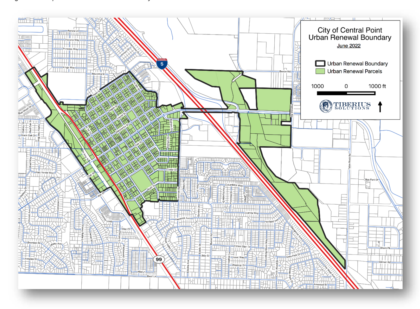
Figure 2 – Proposed Urban Renewal Boundary