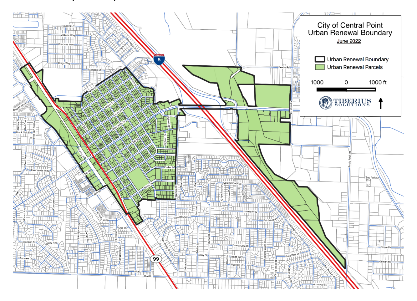
EXHIBIT 2 – Graphic Description of Urban Renewal Area