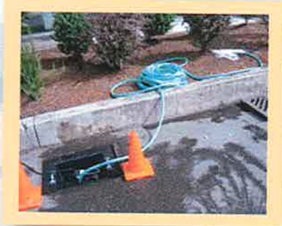
Drain hose into sewer, sink, or ground area