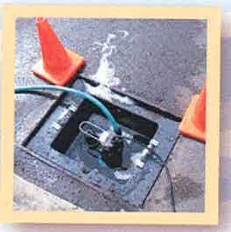
Make sure sump is operating