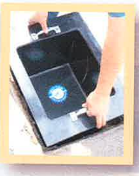
Place tub into catch basin