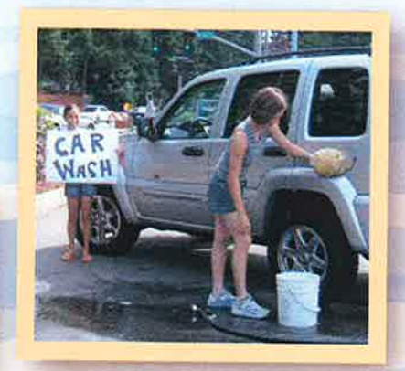
Enjoy your carwash!