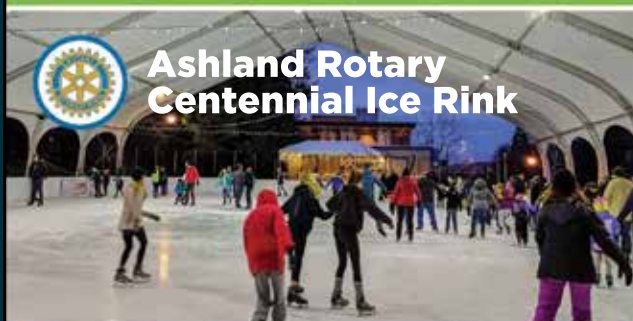
FIGURE & HOCKEY SKATING CLASSES For info: ashland.or.us/IceRink

LEARN TO PLAY GOLF | EVENTS | CLASSES For more information: OakKnollGolf.org