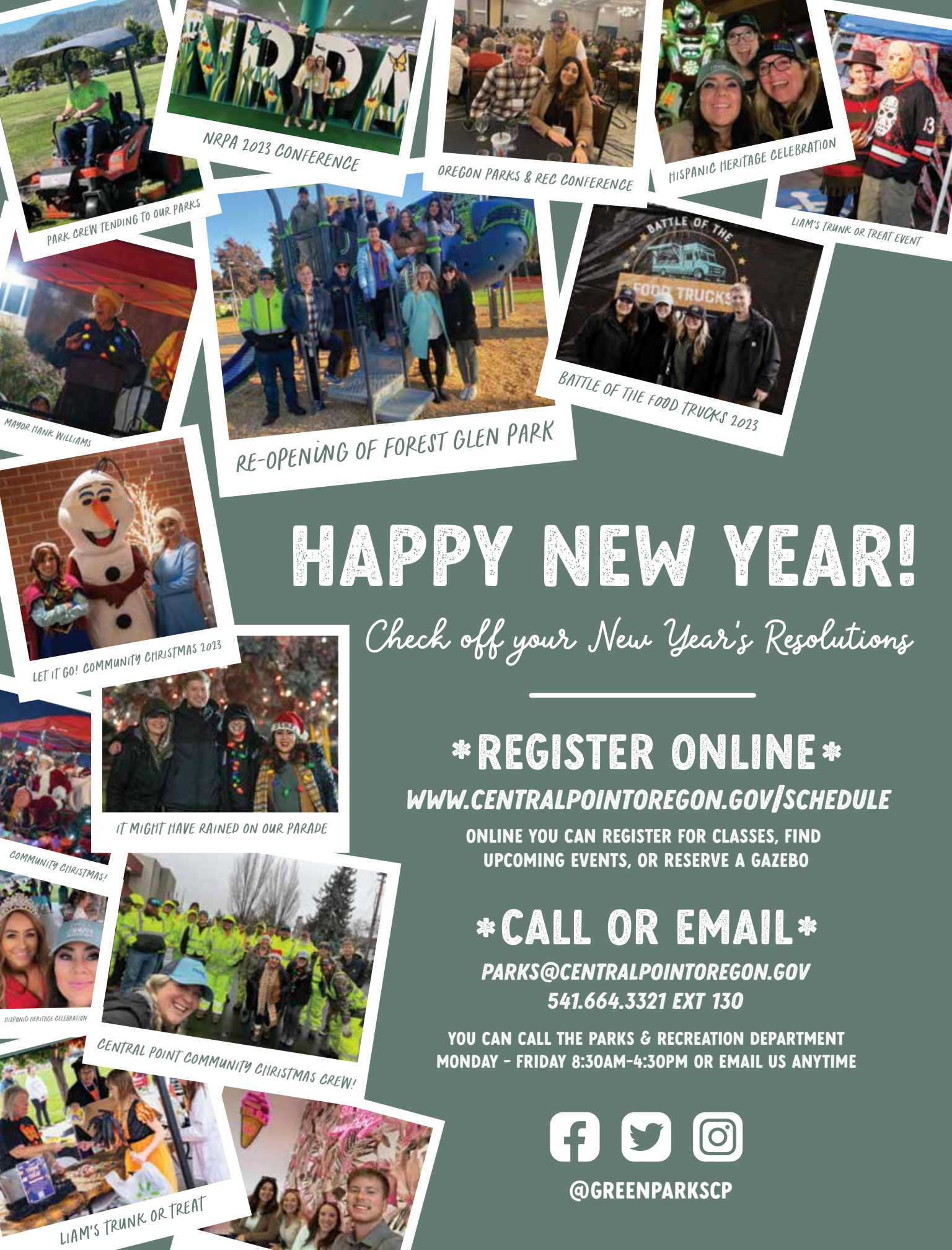
NRPA 2023 CONFERENCE