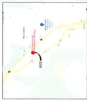
VICINITY MAP NITE

EGGROD FALLS: GENERATION OF (2) FENCED & IRRIGATED PLOTS TO EXISTING BUILDING AND REAR PORT OF INTERIOR