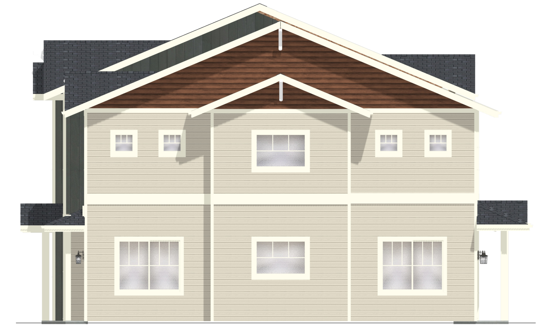
West Elevation (3/16" = 1')