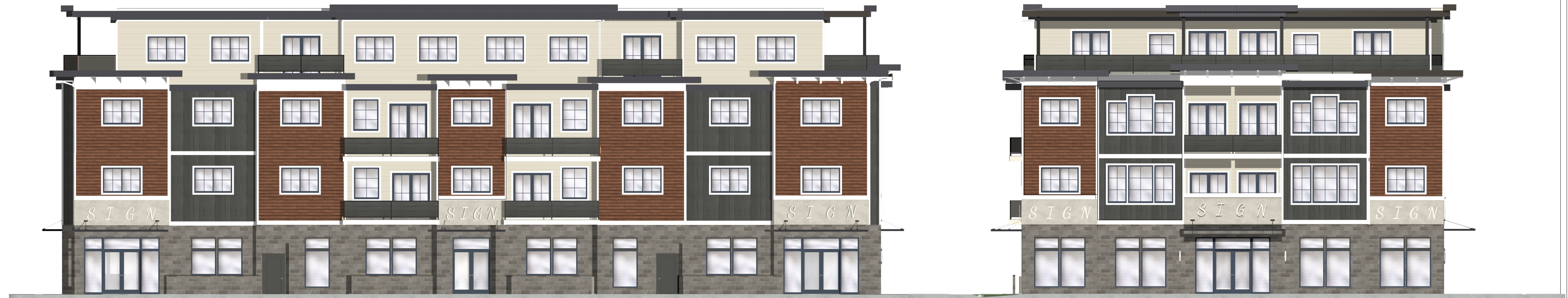
North Elevation - Parking Lot (1/8" = 1')