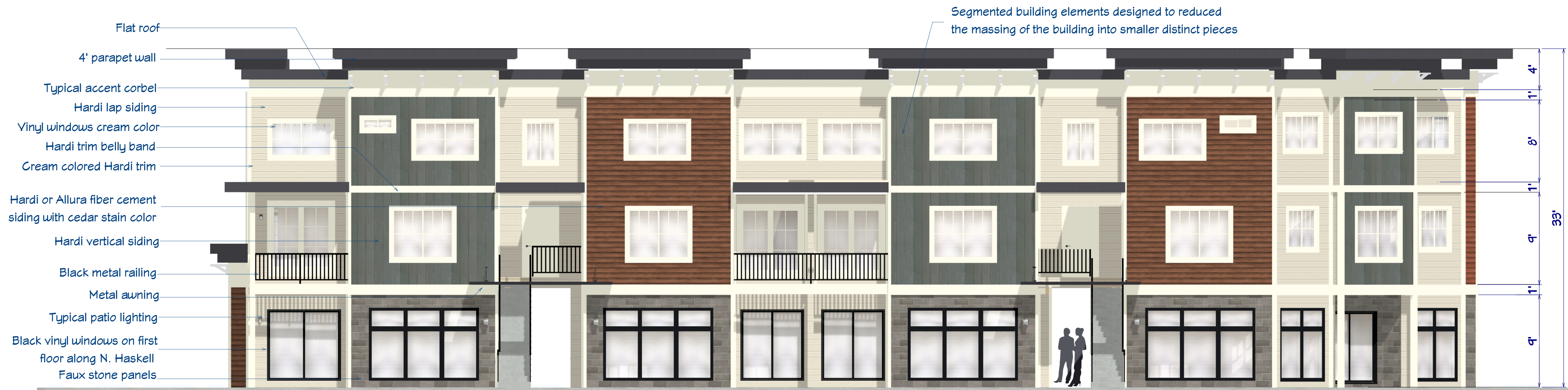
West Elevation - Along N.Haskell (3/16" = 1')