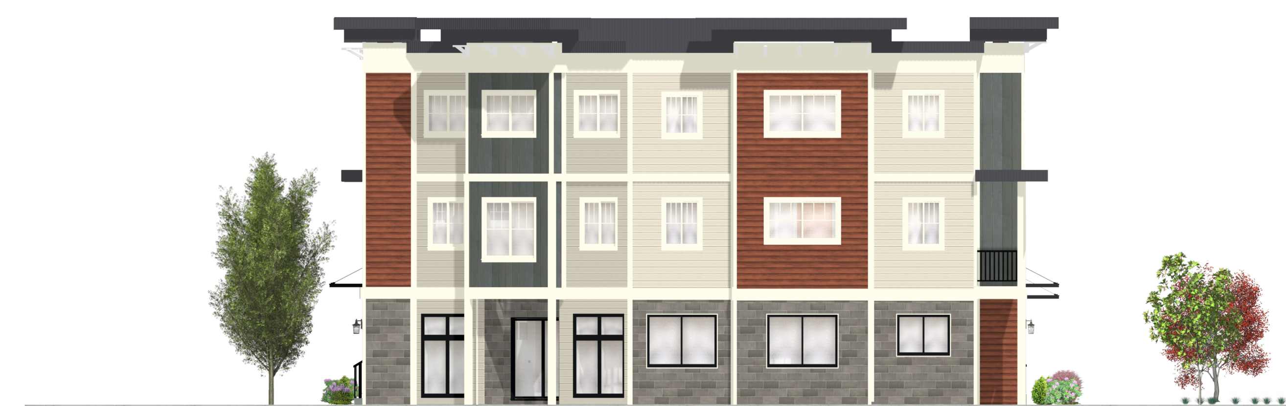
South Elevation (1/8" = 1')