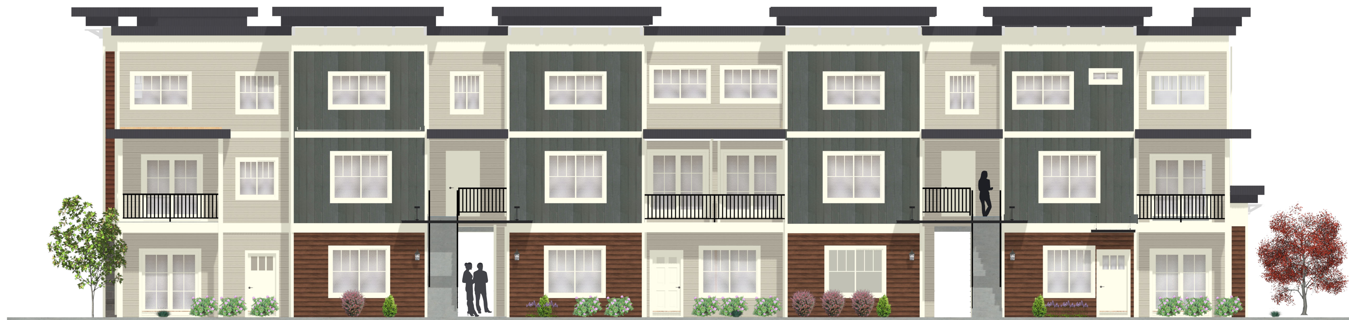
East Elevation - Parking Lot Side (3/16" = 1')