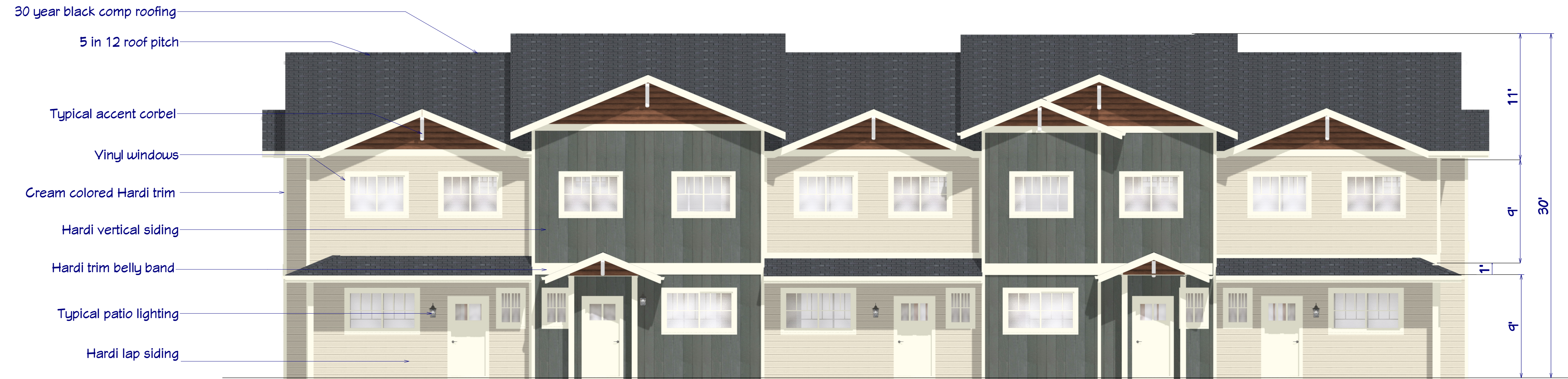
North Elevation - Golden Peak (3/16"=1")