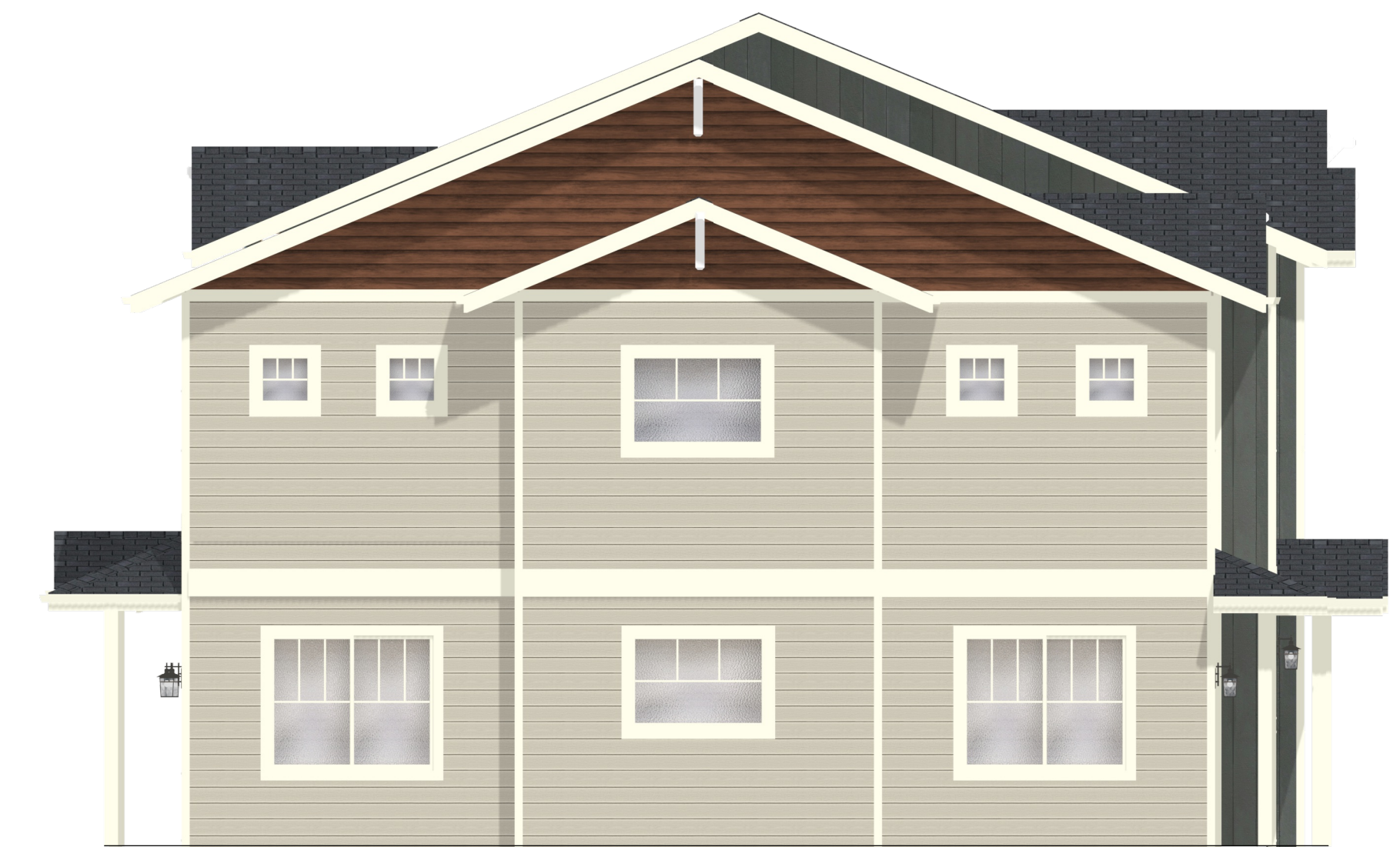
East Elevation (3/16" = 1')