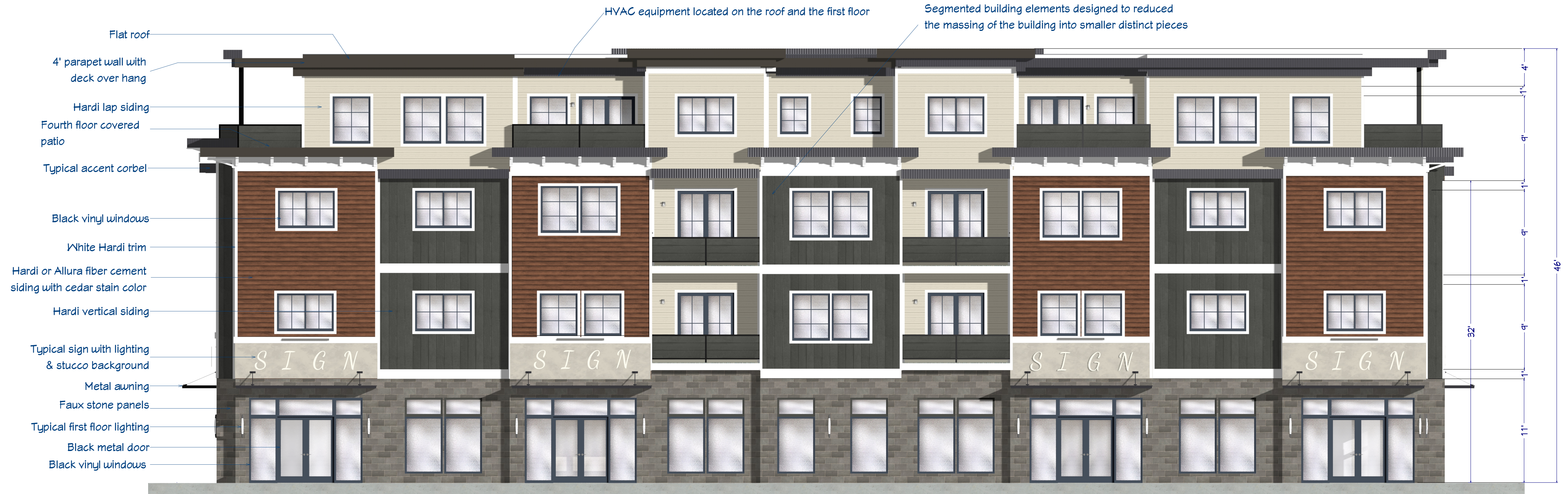
South Elevation - Twin Creeks Crossing Loop (3/16"=1')