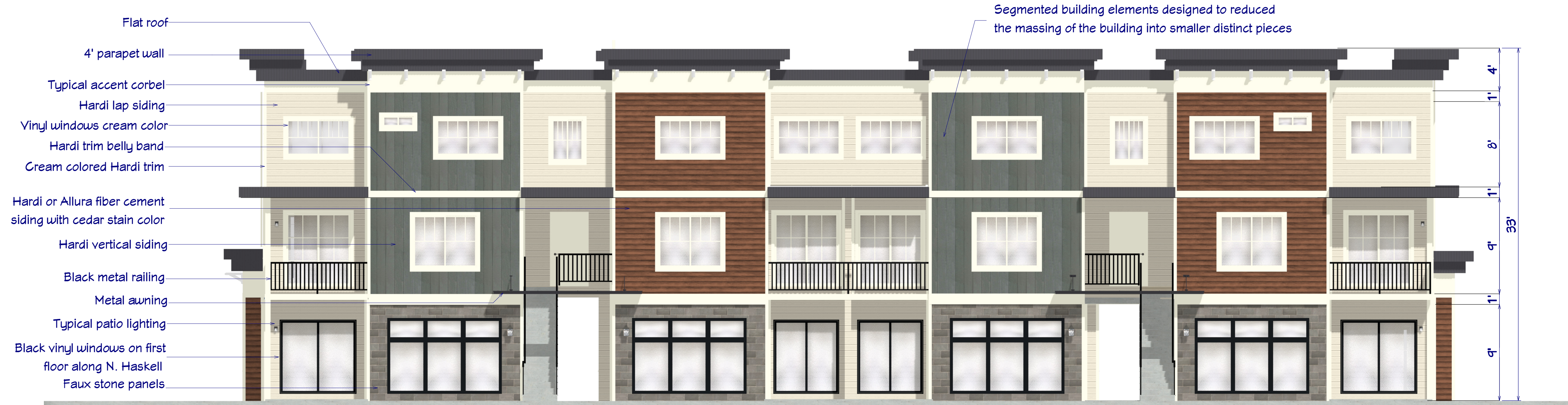
West Elevation - N. Haskell ( Scale 3/16"=1')