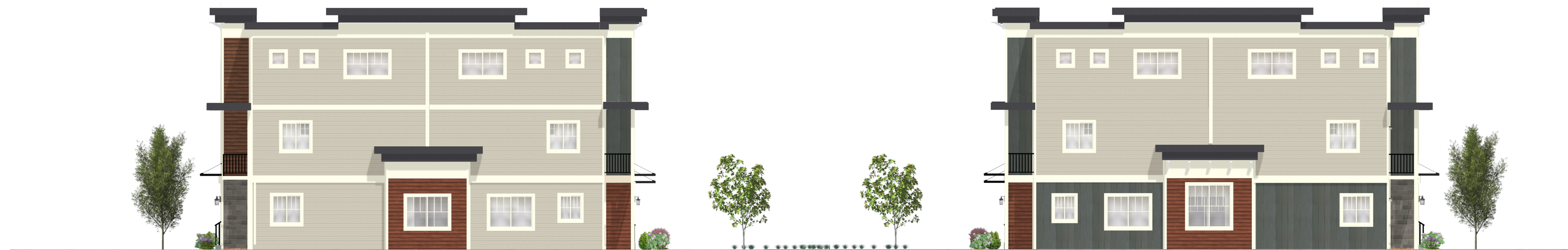
South Elevation - Between buildings ( 1/8" = 1")