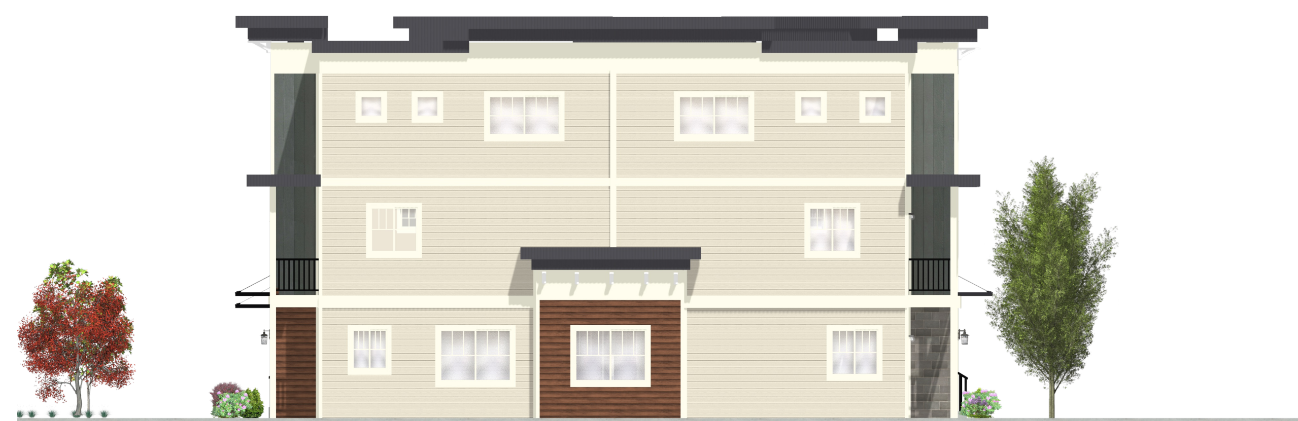
North Elevation - Between Buildings 2 & 3 (1/8" = 1')